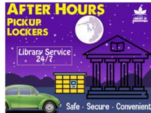
Locker promotion on Gary Byker Library of Hudsonville website